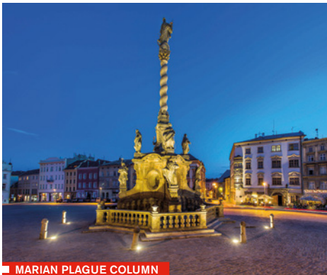
MARIAN PLAGUE COLUMN

oval opening in the centre is decorated with the statues of eight saints, patrons against plague.