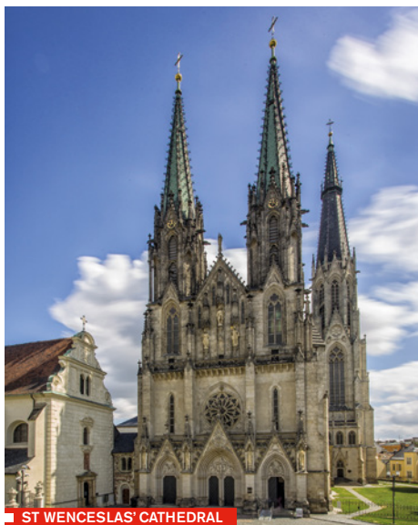
ST WENCESLAS' CATHEDRAL

tower, measuring 100.65 m, is the highest in Moravia. Originally a Romanesque Basilica, it was consecrated by Jindřich Zdík in 1131. Following fires, the cathedral was rebuilt as a Gothic three-nave structure during the 13 th and 14 th centuries. A two-storey crypt from the 17 th century is located under the presbytery; the upper storey serves as an exhibition area, while the lower one contains the tombs of the Olomouc bishops. A shrine with the relics of St John Sarkander canonized by Pope John Paul II in 1995 is placed at a Neo-Gothic altar beside one of the pillars.