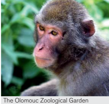
The Olomouc Zoological Garden

can also take advantage of a guided bike tour and learn a lot about the city sights. www.perej.cz , www.olomouc.eu/semafor