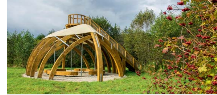
House of Nature