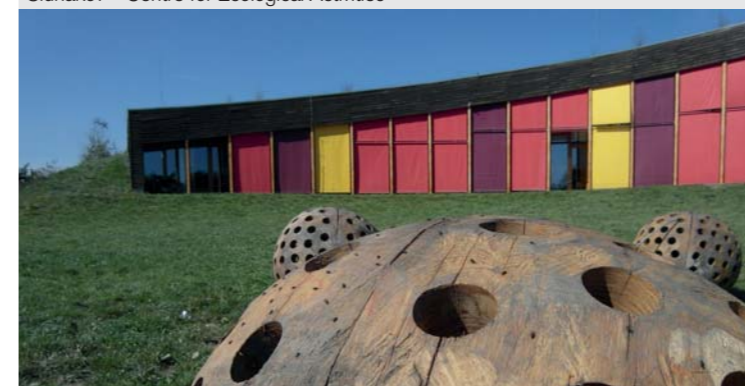
Sluňákov – Centre for Ecological Activities

Explore how people from the Haná region lived in the past. There is a rich collection of handicraft tools, an exhibition dedicated to washing and ironing, collection of toys and an original local pub. Former granaries above the living quarters now serve as a small gallery where up to four exhibits specific to the unique space take place each year. | www.hanackeskanzen.cz