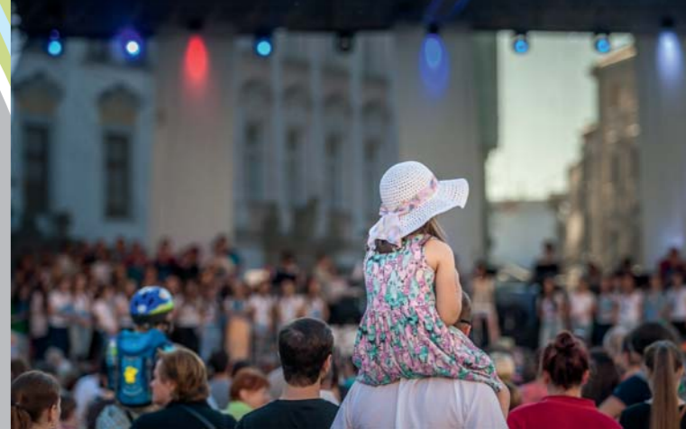
European Heritage Days