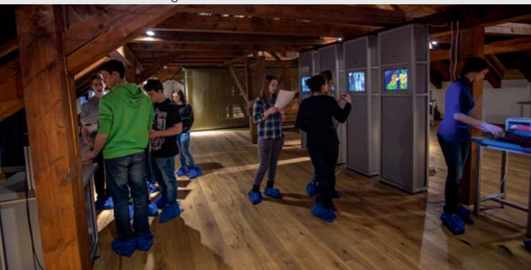
Fortress of Knowledge

by the Baroque painter Ignaz Raab and an underground hermitage with a spring. In the summer months you can relax with your kids in the cloister in the St Michael's garden, which is equipped with climbing frames and swings.