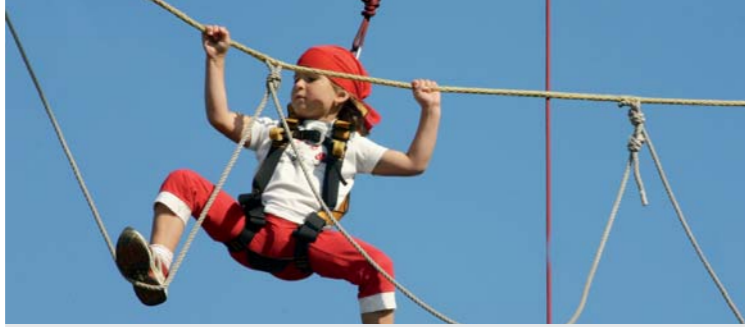
Rope centre Proud

Adrenaline lovers must not miss the Proud and Veverák ropes courses at Holy Hill (Svatý Kopeček). Because meeting the challenge of unusual rope obstacles of varying difficulty eight metres above ground is a great experience. Anyone who tries to suppress his fear of overcoming these obstacles will be secured by a climbing rope. For small kids, elements just slightly above the ground level are available. www.lanovecentrum.cz , www.veverak-kopecek.cz